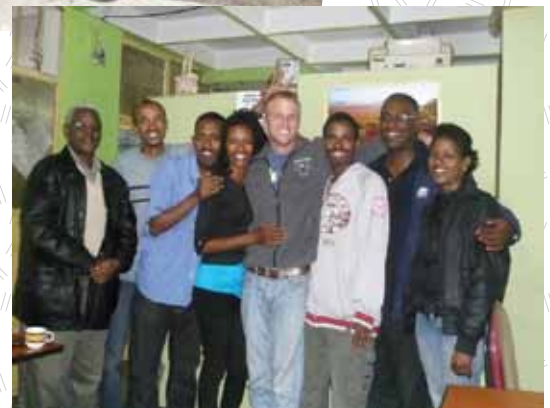
Below: New friends embrace the Texas Aggie!