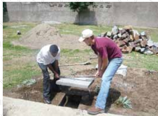
Left: Working at the Medical Clinic in Meki, Ethiopia.