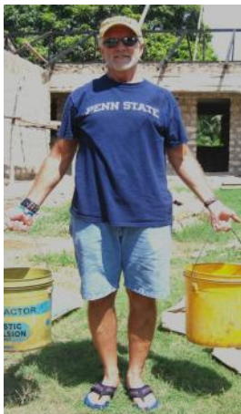
Hauling water for making concrete in Kenya, 2009.