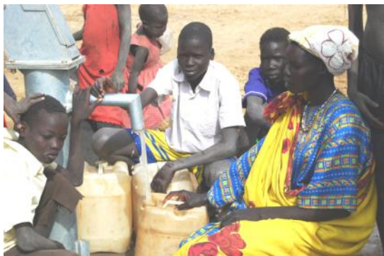
Mother and children drawing water from our first Well in Adoor Village, Sudan, 2008.

group of believers that simply cannot stand to see others suffer. Us is the many members of Alamo Heights Methodist Church (the Outreach Committee in particular), and an incredible Sunday School class there, the Open Door Class. Us is the many friends of CrossWay International who stay involved with our