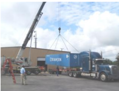
Loading container onto transport trailer.

well project, and most recently, I went to Kenya with him in April. These trips overseas have only served to make me want to get more clean water to more people. CrossWay International was already involved in water well drilling overseas, but our new division set the bar even higher. We decided to pursue the fabrication of our own drilling rig and ship it overseas so that we could drill more wells in less time, for less money. We had the rig made here in TX, and then the real work began (on our end) to prepare it for its trip overseas.