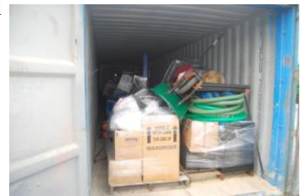
The trailer is finally all loaded.