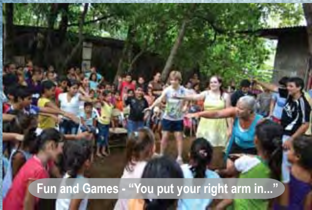
Fun and Games - "You put your right arm in..."

Children, children everywhere! The rest of our group made up a children's ministry team. They went out every day into different areas of the country doing songs, skits and puppet shows for children. They ministered to various groups that our Nicaraguan contacts had arranged (a school for special needs children, a feeding program for hungry children, etc.), and did street witnessing as well. By the end of our stay, 375 children had said they were putting their trust in Christ for the first time in their lives – isn't that fantastic!