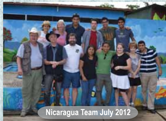
Nicaragua Team July 2012