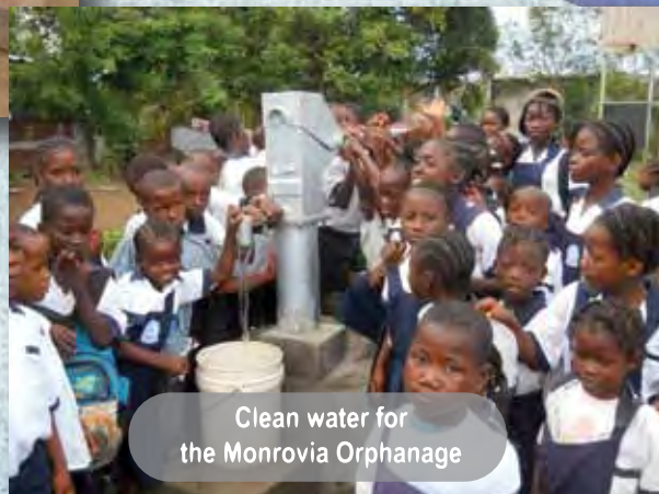
Clean water for the Monrovia Orphanage