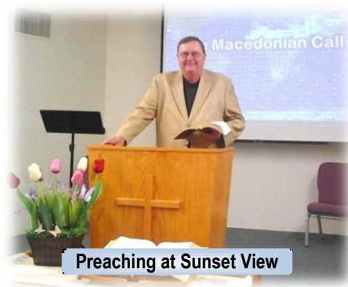
Preaching at Sunset View

As we spent a few days together getting caught up on the last 35 years and catching a few trout, I was amazed at all the similarities in our lives. We both like fly fishing, we and our wives had been active in the Awana children's ministry, both our wives were medical professionals, and we both had one son and one daughter. It seemed as if I'd found my long lost twin brother (even though we look as different as Arnold Schwarzenegger and Danny DeVito). But the neatest thing that God did in our renewed relationship is to call