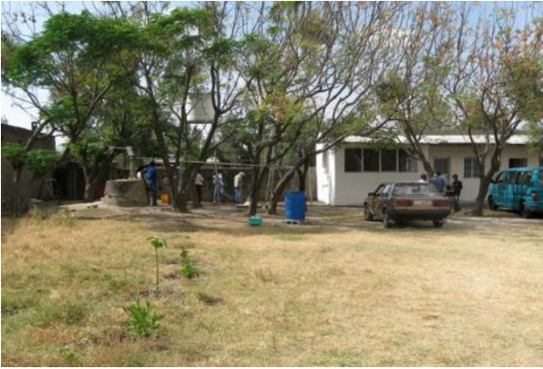
CrossWay-Ethiopia Meki Medical Compound

Another praise point that we have is in connection with the Meki clinic that Crossway-Ethiopia is about to launch in few months. So far we have been working on finalizing the renovation work of the clinic in the compound that we bought by your generous gifts. Now we are able to purchase the medical and non-medical equipments that we needed to function as a legal clinic in Ethiopia. We are very much excited to see the Lord's faithfulness to raise people who give generously for the advancement of His kingdom. God bless you all. Please pray for the rest of the things that we need to start the work officially—specifically, please pray for Christian medical profes-