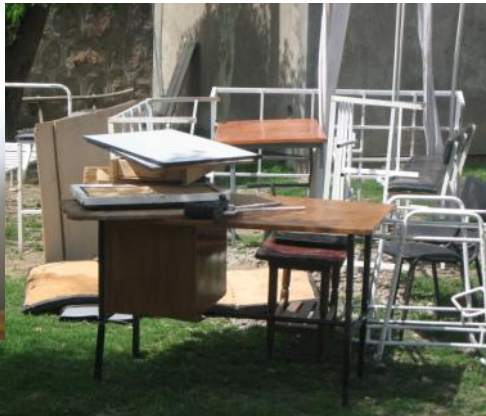
R: Furniture ready to be assembled for the clinic.