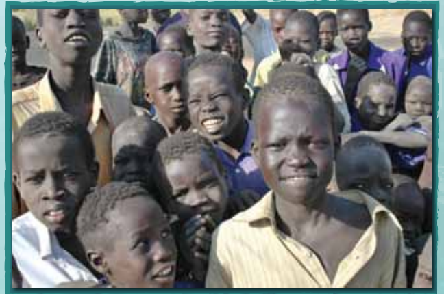
Orphans in Sudan

Our first strategy, Opening Hearts to the Gospel, came about from a trip to Sudan back in May of 2007. I was asked by a Christian leader to come to a remote area of what is now the northern part of South Sudan and teach a 3 day seminar on evangelism to 135 pastors from that area. This mission trip ranks near the top in terms of the physically, emotionally and spiritually challenging trips. At this time, I was totally blind but trusted the Lord to lead and keep me safe. While on this trip, the local leaders shared with me that 150 orphans had been "dumped" outside their village and were in dire need of help. "Is there anything you can do?" they asked. I explained that this was really outside the scope of our ministry but, nevertheless, I would include this need in my next prayer letter and see how the Lord might lead. The Lord was