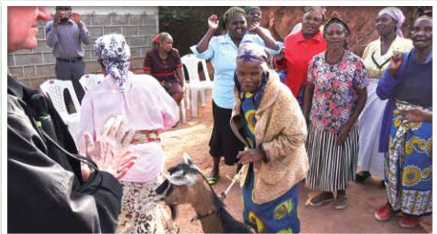
4 widows are happy to receive milk-goats from CrossWay